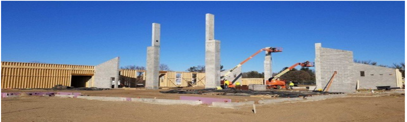
Photo looking Northwest at the foundation, walls and support of the Gathering Space, Worship Space and Administrative Space.

THIRTY - SECOND SUNDAY IN ORDINARY TIME, NOVEMBER 10, 2019